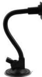
4. Additionally, some kits come with a Gooseneck Suction Cup Bracket for mounting the cradle to the windshield.