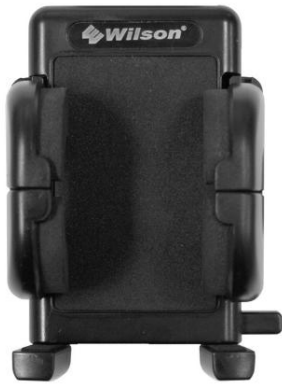
Cell Phone Cradle (Part # 859942)

Wilson Electronics' Cell Phone Cradle is a lightweight, versatile product that enables you to place your cell phone in a convenient location in your vehicle and use it with a hands-free device such as an ear bud or Bluetooth® product. Doing so lets you keep both hands on the wheel, thereby maintaining your safety while allowing you to carry on a cell phone conversation.