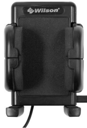
Cell Phone Cradle Plus (Part # 301146)

Wilson Electronics' Cell Phone Cradle Plus offers all the convenience features of the standard cradle with the added benefit of a built-in cell phone signal antenna/coupler. Used in conjunction with one of Wilson's cellular amplifiers, the Cradle Plus can improve your cellular signal up to 10 times and help you stay connected in places you never could before!